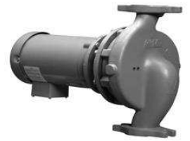
“1900” Series Bronze In-Line Pumps